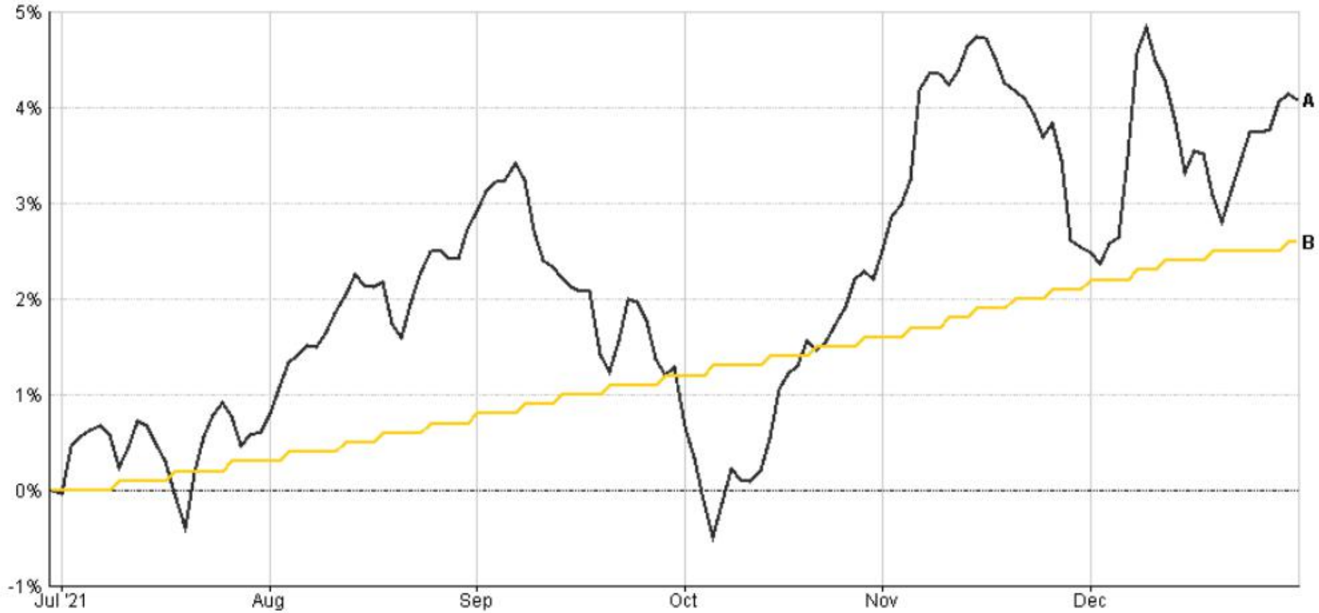
Pricing Spread: Bid-Bid • Data Frequency: Daily • Currency: Pounds Sterling