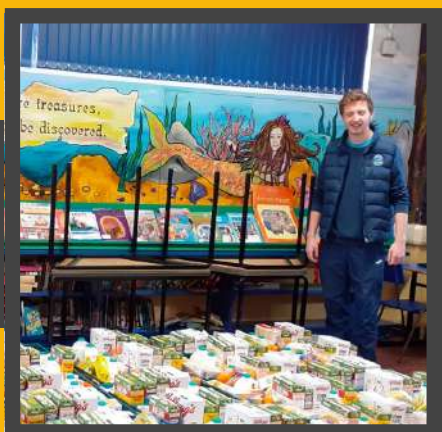
Green Island Football Belfast £10,000

The “aftermath” of this global pandemic will continue long into 2021, increasingly impacting the places and people around us. As such the Foundation has chosen to expand its criteria, as detailed above, but remains committed in supporting its original themes: Health, Social, Education and Innovation.