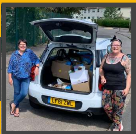
Eyres Monsell Club for Young People Leicester £3,472

Alongside developing the criteria to focus on those who were responding to the ever-changing community needs, Wesleyan were one of the first organisations to support Heart of England Community Foundation's Coronavirus Resilience response with £10,000 and have provided additional support to organisations who were improving conditions and opportunities for specific community groups in particular; Black/Afro-Caribbean and any other underrepresented groups.